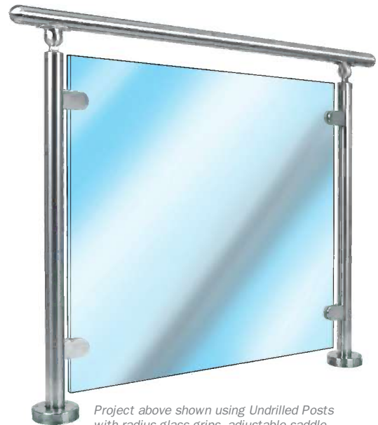
Project above shown using Undrilled Posts with radius glass grips, adjustable saddle, tubing with half-ball end cap and flange canopy (see back for item numbers).