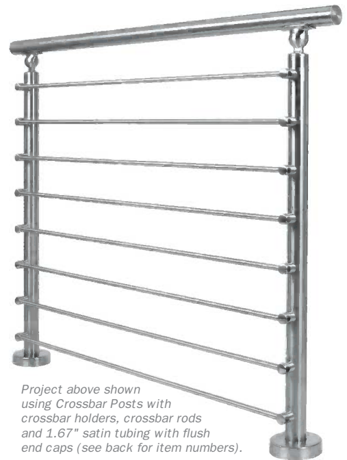
Project above shown using Crossbar Posts with crossbar holders, crossbar rods and 1.67" satin tubing with flush end caps (see back for item numbers).